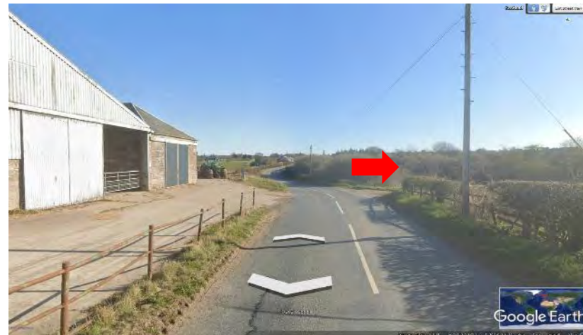
Point 3 – entrance to Upper Beat