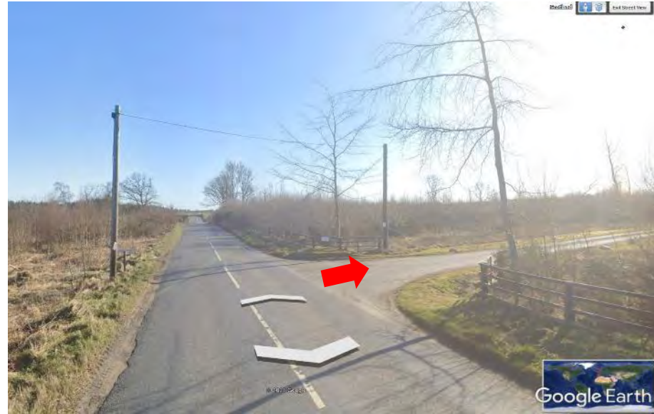
Point 2 – entrance to Lower Beat