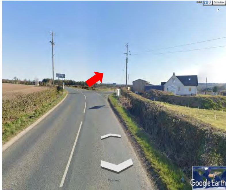
Point 1 – Approaching Right Fork